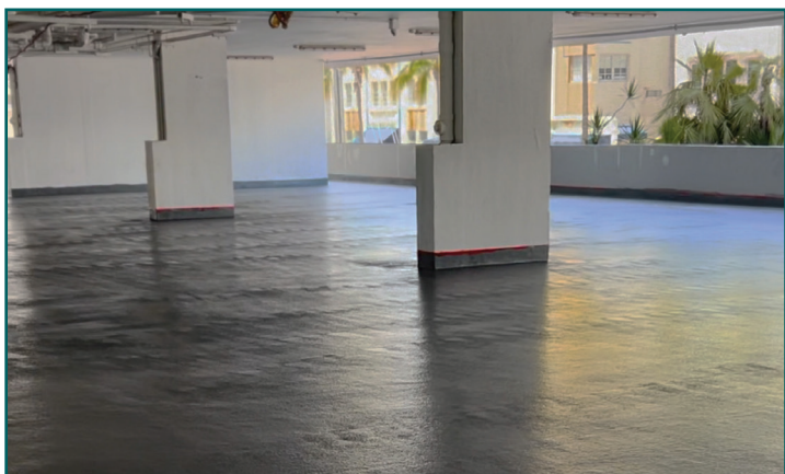
Vehicular Traffic-Bearing Surfaces

From parking garages to pedestrian decks and walkways , the system delivers a seamless, traffic-rated membrane designed to endure movement, water intrusion, and long-term wear.