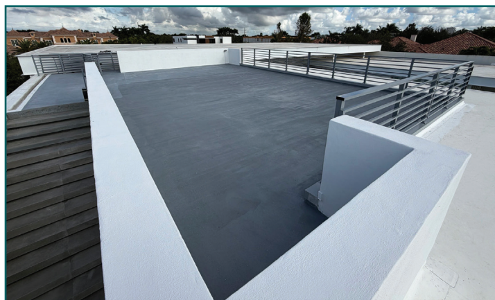
Pedestrian Decks & Walkways