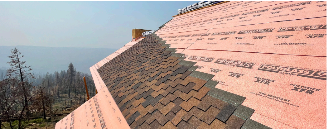
Polystick XFR provides tested ember & fire resistance for urban areas and regions prone to wildfires