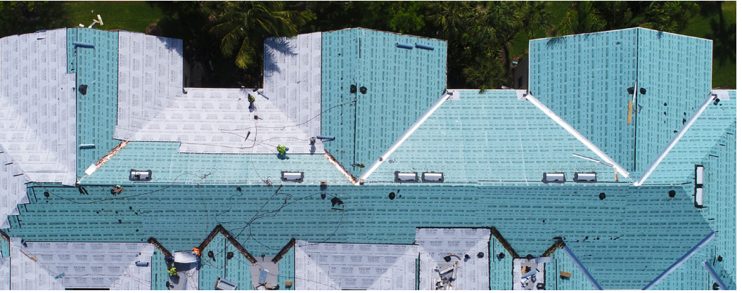
Polystick MTS PLUS can be used as a single layer high temp underlayment or as a base layer in a two-ply system for up to 30 year warranty.