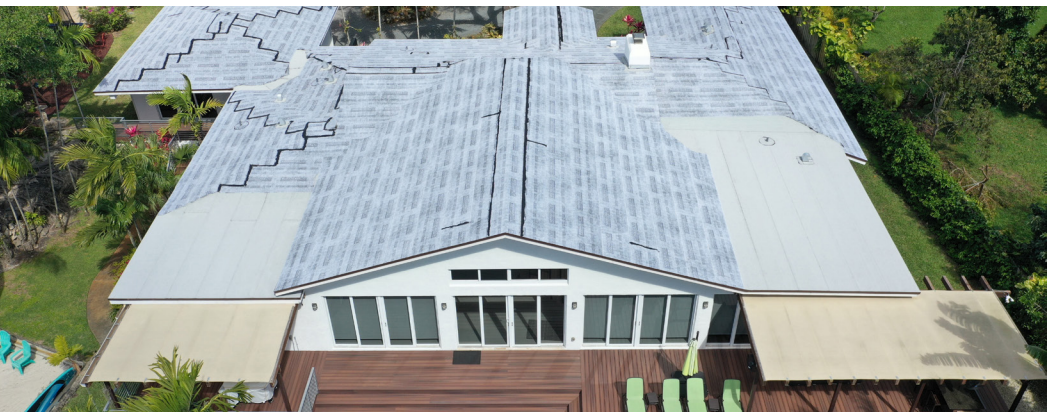
Polystick TU Plus has been a proven wind and waterproofing barrier for over 20 years.