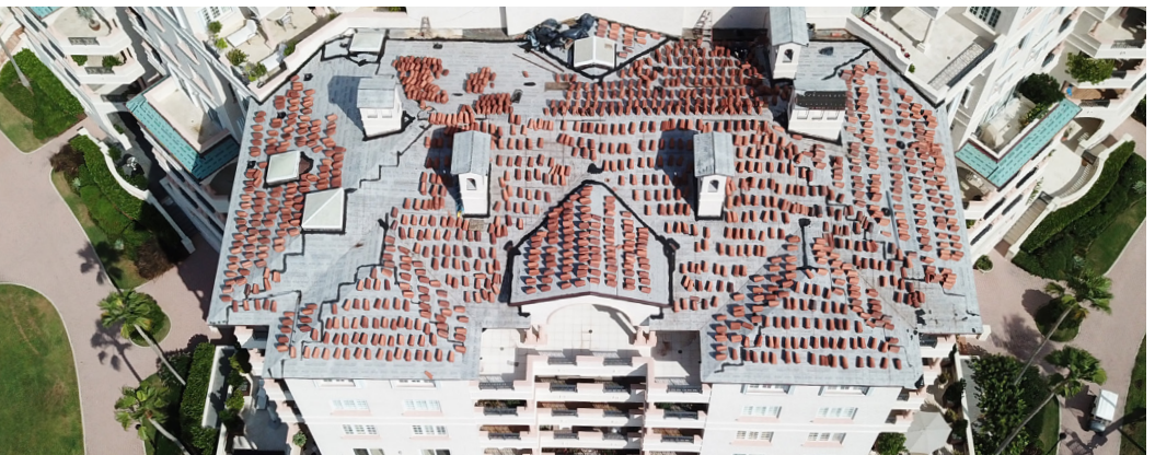
Polystick TU Max has a tough top fabric design engineered for foam set or mechanically fastened tiles.